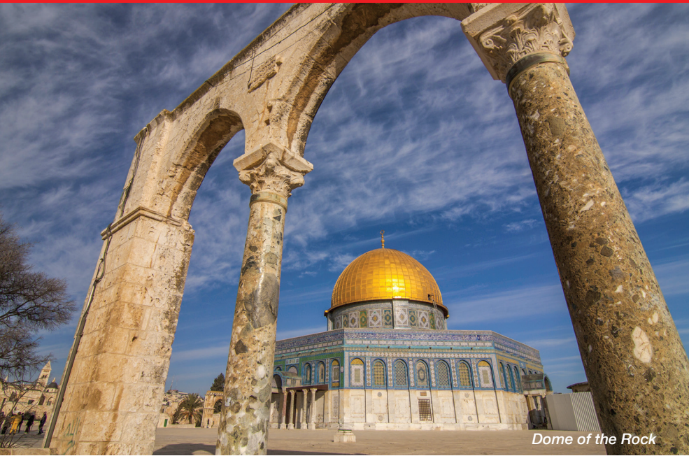
Dome of the Rock